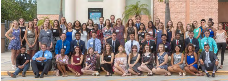
Class of 2017 gathers at Vero Beach High School before the 52nd Annual Awards Ceremony

Scholarship Foundation awarded 105 college scholarships to 53 local students at its 52nd Annual Awards Ceremony, held at the Vero Beach High School's Performing Arts Center on May 17, 2017. This year's recipients will receive $738,500 in need-based financial aid over the next four years to attend 20 colleges and universities in nine states.